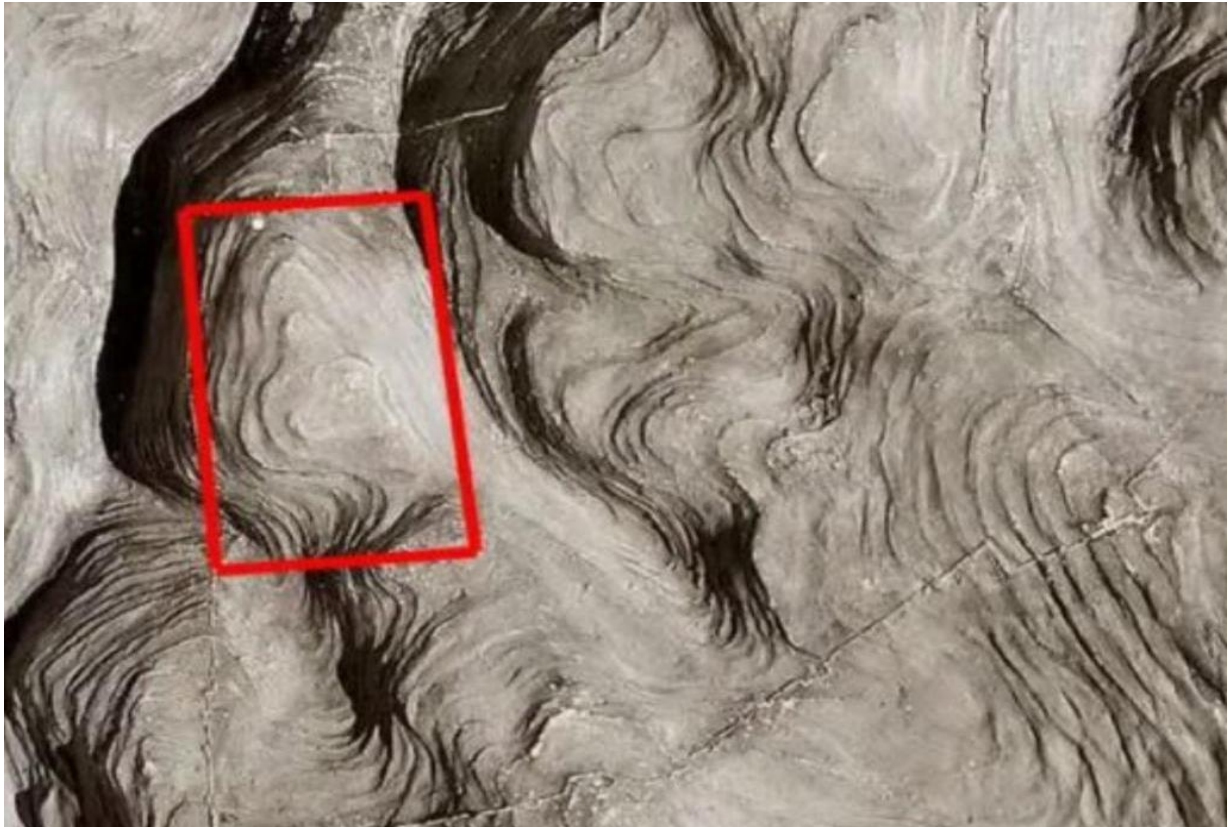
(Above: The topography of the land, in red the Sacred Land of al-Aqsa Image taken from 'El-Awaise (2008) 'Geographical Dimensions of Islamic Jerusalem

It is important to understand that Islam is the oldest religion on Earth as it reveals Masjid al-Aqsa's origins to be purely Islamic. Masjid al-Aqsa therefore belongs to all Muslims who hold the sole rights to enter and pray inside the Holy House of Allah.